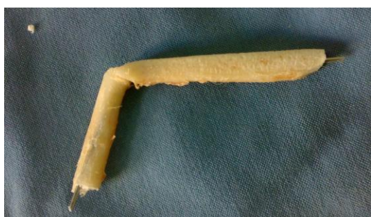
Fig1: Integrated wired rib cartilages in a shape of L-strut.

In this technique, after the 10 th and 11 th rib cartilages were harvested from the left side of the chest wall, with the 10 th cartilage being carved for the dorsum and the 11 th cartilage being carved for the columella. Then using a microdrill, the 0.035 inch Kirschner wire was passed through the core of both pieces of the prepared grafts. Then Kirschner wire was placed at approximately a 115 degree angle as an L-Strut. The Kirschner wire should have 5 to 8 mm of protrusions from both ends (Fig.1).