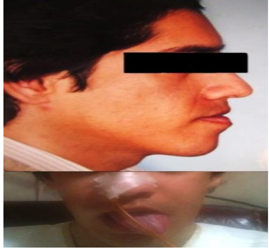
(bottom) the corrective jaw surgery. Tongue deviation due to hypoglossal nerve paralysis is seen.

Fig 2: The patient before (top) and 1 month after