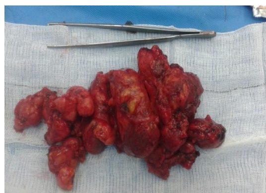
Fig 1: Macroscopic illustration of axillary lymph nodes.

The patient underwent dissection of the left axillary lymph nodes. Lymphadenopathy was detected at levels I and II without further extension (Fig. 1). There was no involvement of the vessels or large nerves, including long thoracic or thoracodorsal nerves. Postoperative histopathology confirmed metastatic medullary thyroid carcinoma in the resected lymph nodes (Fig. 2).