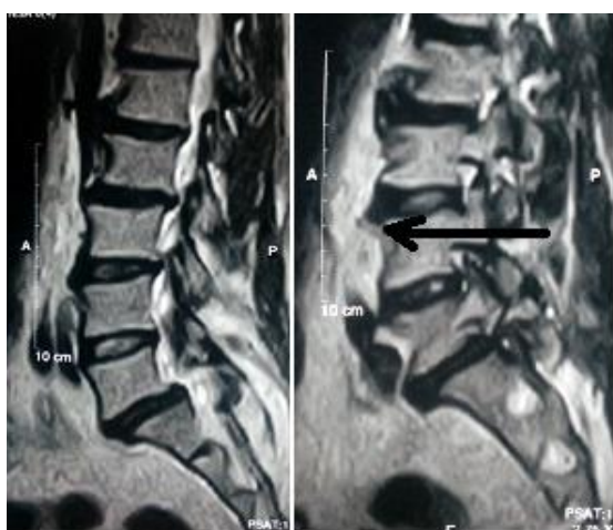
Fig 4: Ossification of the lumbar spine from L1-L5 vertebrae

Upper Gastro-intestinal tract endoscopy, another important investigation for dysphagia, was not performed in this case as there was no intraluminal mass lesion detected in the CT scan. There was another segment showing ossification of the lumbar spine from L1-L5 vertebrae (Fig.4). We advised the patient to have a surgical removal of the osteophytes; but he refused to do any sort of surgical intervention. So we advised him to avoid solid food and ingest soft semisolid food in a small bolus instead. After a 3-month of follow up, the patient was doing well and was satisfied with his diet therapy.