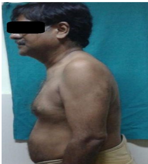
Fig 1: Typical posture of the patient

A 49-year-old gentleman came to our institute with dysphagia for the last two years. The dysphagia was gradually progressive in nature and was more for solid than liquid. There was no associated pain during deglutition. The patient had been treated by several physicians for one and a half years for the same complaint but without any relief. The patient lost 5-6kg of weight during this period. He was earlier diagnosed with cervical spondylosis and treated with a cervical collar, analgesics, and neck exercises. However, nothing could relieve his main complaint of dysphagia. When the patient arrived in our clinic, his body posture was stooping forward and he was having difficulty in straightening his torso over his pelvis (Fig.1).